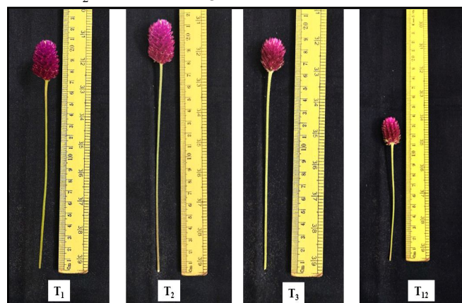
Fig. 2: Stalk length (cm) of gomphrena as influenced by different growth regulators.

At 90 DAT, T_2 documented a maximum photosynthetic rate ( 7.20 \mu\text{mol CO}_2 \text{ m}^{-2} \text{ s}^{-1} ), which was at par with T_3 , T_9 , T_1 and T_{13} ( 7.16 , 7.08 , 7.06 and 7.05 \mu\text{mol CO}_2 \text{ m}^{-2} \text{ s}^{-1} ), whereas the minimum was registered in T_{16} ( 5.31 \mu\text{mol CO}_2 \text{ m}^{-2} \text{ s}^{-1} ). The treatment T_2 ( 0.24 \text{ mmol H}_2\text{O m}^{-2} \text{ s}^{-1} ) registered maximum stomatal